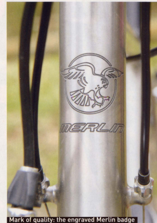
Mark of quality: the engraved Merlin badge